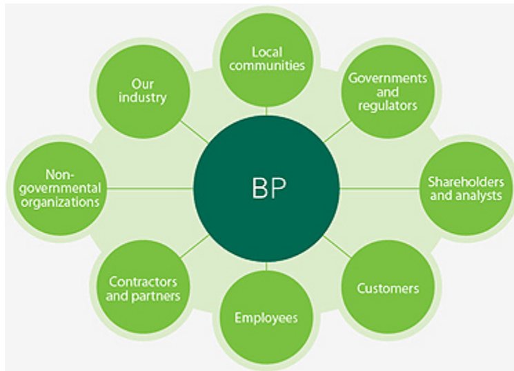
Stakeholder’s Engagement Chart (Sustainability, 2012)

We can only operate if we maintain the trust of people inside and outside the company. We must earn people’s trust by being fair and responsible in everything we do. We monitor our performance closely and aim to report in a transparent way. We believe good communication and open dialogue are vital if we are to meet the expectations of our employees, customers, shareholders and the local communities in which we operate. (Sustainability, 2012)