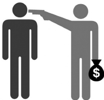
capitalism (described by socialists)