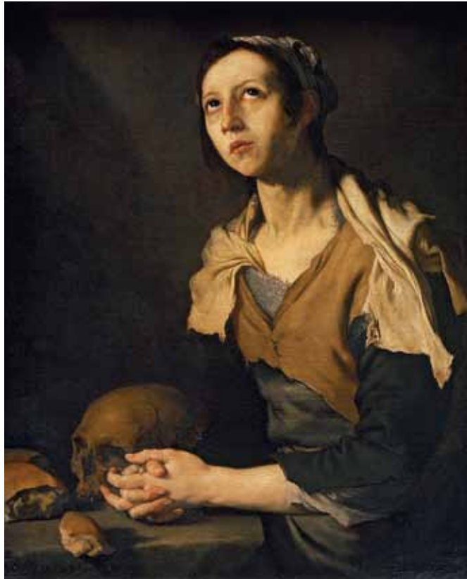
Jusepe de Ribera, Saint Mary of Egypt, 1651. Oil on canvas. Museo Civico Gaetano Filangieri, Naples, 1440.