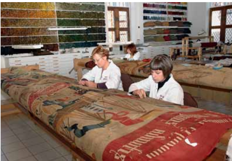
Conservation of the tapestries: Process of stabilizing the fragile parts of the fabric tapestries on the restoration benches. Collegiate Church of Our Lady of the Assumption, Pastrana, Spain.

The exhibition is organized by the National Gallery of Art, Washington, and the Fundación Carlos de Amberes, Madrid, in association with the Embassy of Spain, the Spain-USA Foundation, and the Embassy of Portugal and with the cooperation of the Embassy of Belgium and the Embassy of Morocco in Washington, D.C. Generous financial support from The Meadows Foundation has helped to make the Dallas venue possible.