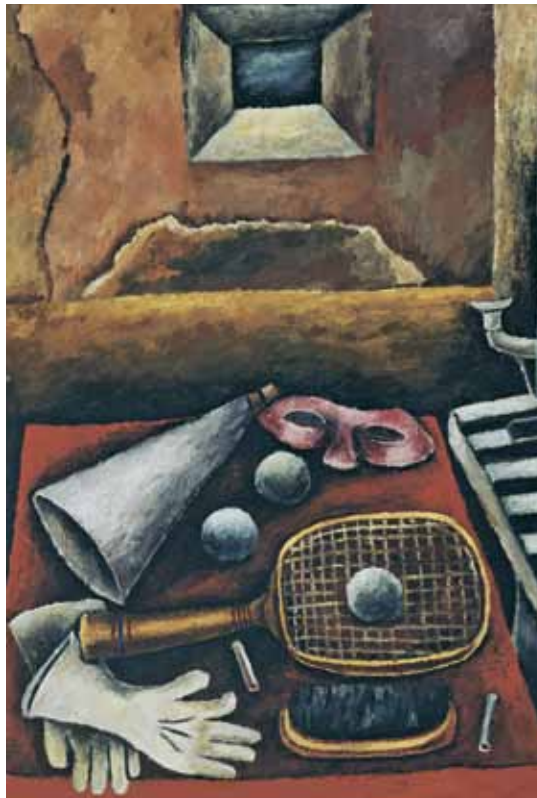
ABOVE: Feliciano Peña, Self-Portrait (Autorretrato) , 1941. Oil on canvas. BELOW: María Izquierdo (1902-55), The Racket (La raqueta) , 1938. Oil on canvas.