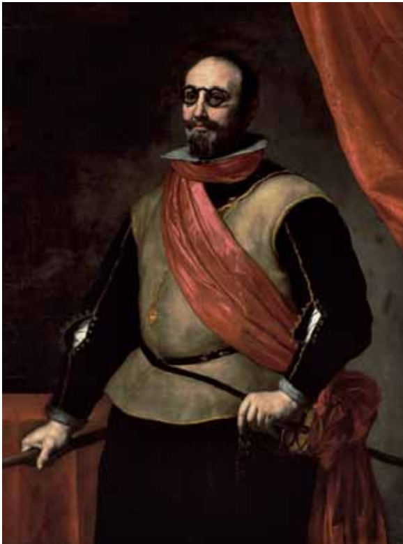
Jusepe de Ribera, Portrait of Knight of Santiago , 1630-38. Oil on canvas. Meadows Museum, SMU, Dallas. Algur H. Meadows Collection, MM.77.02.