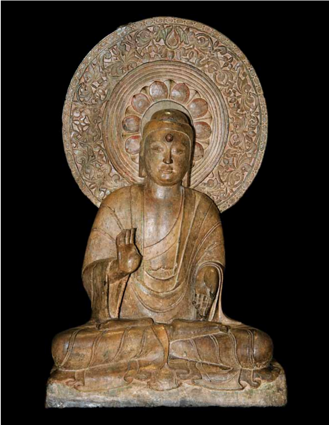
Seated Buddha , sixth century. Limestone freestanding sculpture with traces of pigment and lacquer. Xiangtangshan, northern group of caves, attributed to North Cave, perimeter wall niches. Victoria and Albert Museum, London. Presented Through the National Art Collections Fund by a Body of Donors, A4-1924.