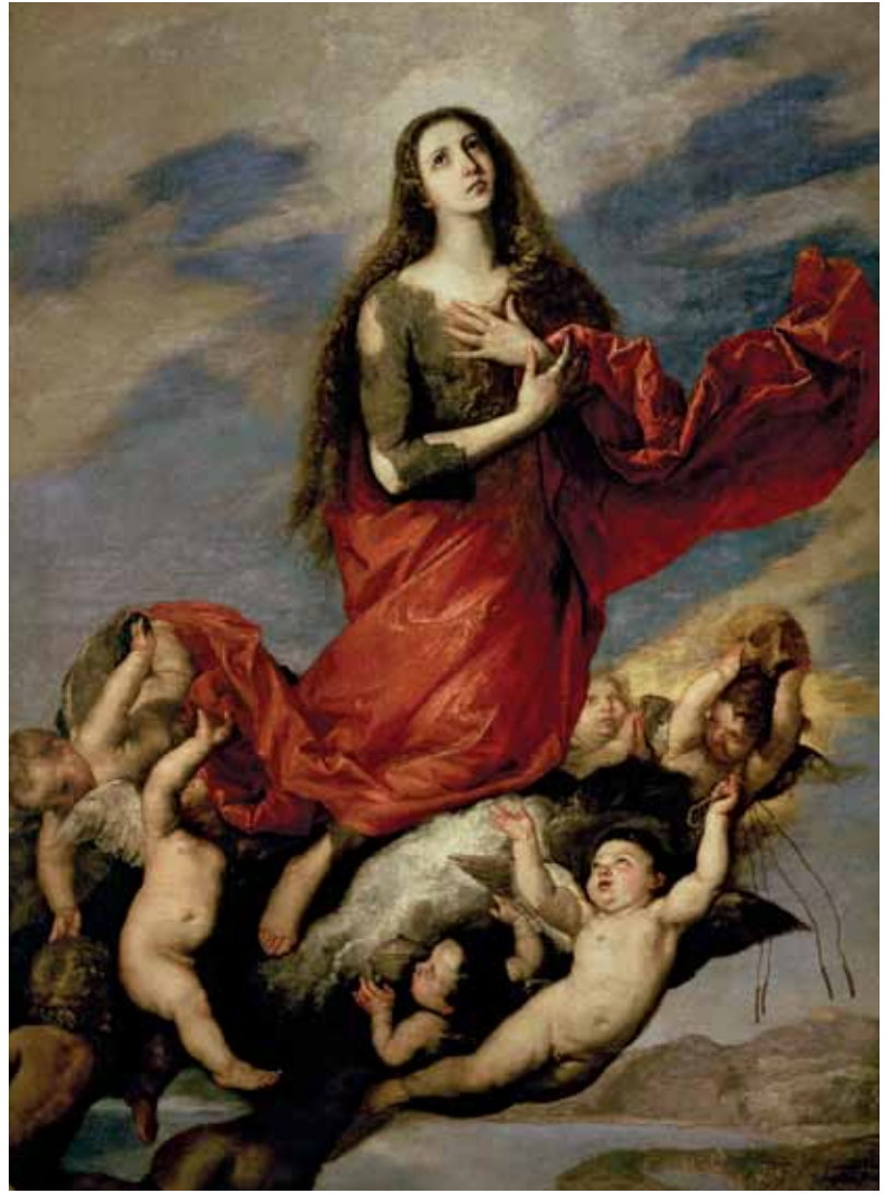
Jusepe de Ribera, Assumption of the Magdalene , 1636. Oil on canvas. Museo de la Real Academia de Bellas Artes de San Fernando, Madrid, 636.

Beyond socioeconomic concerns, Ribera's dualistic identity was manifested in the style of his painted canvases and graphic works. His art was thoroughly affected by Caravaggio's brand of chiaroscuro , identified by the illumination within a painting via an overhead light source. The influence of Caravaggio's