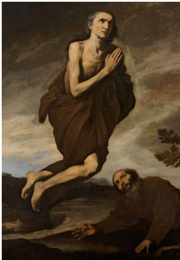
Jusepe de Ribera, Saint Mary of Egypt in Ecstasy, c. 1640. Oil on canvas. Colección Pérez Simón, Mexico City.

Ribera's singular style was more attributable to his own individual sensibility than to any nationalistic artistic conventions, however. The painter pushed the boundaries of naturalism in terms of both subject matter and painterly device. Although Ribera worked in various modes of painting, from genre to mythological and biblical scenes, the brutal realism with which he painted martyred saints earned him a reputation in the seventeenth century as "the cruel Ribera." This notoriety carried on through centuries. In the nineteenth century, Lord Byron wrote in his poem Don Juan that Ribera had "tainted His brush with all the blood of all the sainted," summarizing Ribera's deeply incised reputation as a painter of violent martyrdom and mythological torture.