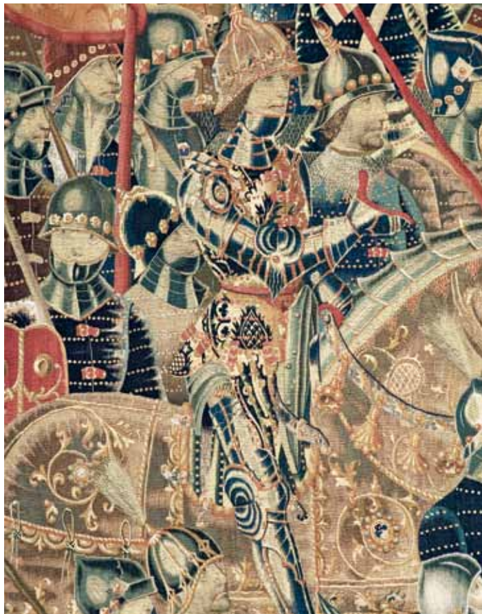
Siege of Asilah (detail). Attributed to the workshop of Passchier Grenier, Tournai (Belgium), last quarter of the fifteenth century. Wool and silk. Collegiate Church of Our Lady of the Assumption, Pastrana, Spain.

Ostensibly a fight of faith, Afonso’s Moroccan invasion was also a victory for Portugal’s expansionist policies. Three of the four tapestries narrate respectively the Portuguese landing, siege, and triumph at Asilah in 1471. Once Asilah fell, Tangier—the Portuguese occupation of which is the subject of the fourth tapestry—was in no position to resist the Portuguese.