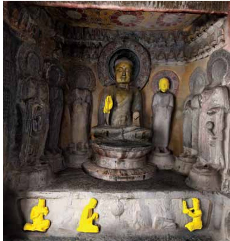
Still of screen from Digital Cave: view of north altar of the South Cave, northern Xiangtangshan, with 3-D reconstruction of dispersed sculptural fragments shown in yellow against colored (texture-mapped) cave setting.

The works on view are on loan from the Asian Art Museum of San Francisco, the Cleveland Museum of Art, the Metropolitan Museum of Art, the University of Pennsylvania Museum of Archaeology and Anthropology, the San Diego Museum of Art, the Victoria and Albert Museum, and the Virginia Museum of Fine Arts. ■