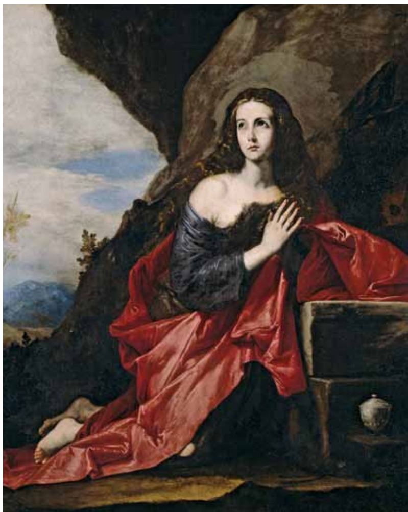
Jusepe de Ribera (Spanish, 1591-1652), Mary Magdalene, 1641. Oil on canvas. Museo Nacional del Prado, Madrid, P1103.