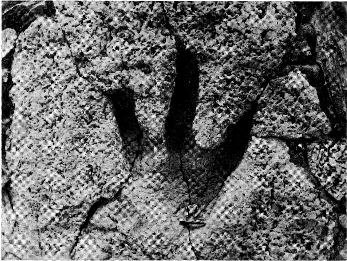
Figure 1. Dinosaur track mounted in the band stand, Glen Rose.

The track does not give positive evidence as to whether or not the toes were terminated by hoof-like or claw-like ends. The fact, however, that the mud was not largely disturbed on the withdrawal of the foot seems to indicate considerable flexibility in the toes. As the dinosaur lifted its foot, the toes automatically retracted and closed so that the track was left almost a perfect mold except for a slight in-push of the sticky lime mud into the opening. Undoubtedly the ends of the toes came to a fairly sharp point. The palm of the foot has a width of about 12 inches, and the cast of the foot shows that it was definitely convex. On the other hand, the cast shows that the undersurface of the toes was not developed into pads, but was flat.