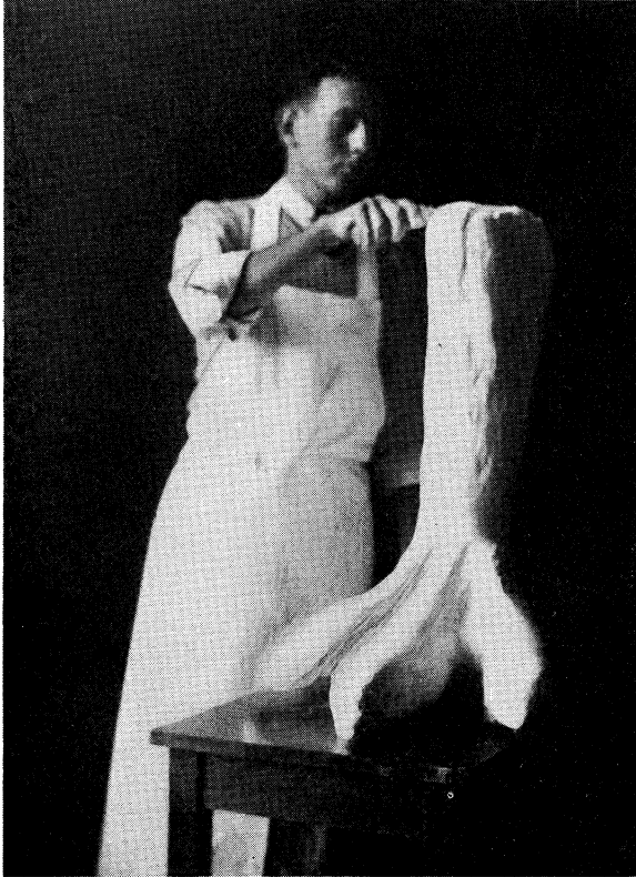
Figure 4. Restoration of Dinosaur foot and lower part of leg.

Figure 2 shows a cast made with modeling clay. The clay was plastered over the bottom, sides, and ends of the toes of the original track to a thickness of about \frac{1}{2} inch; then a core of plaster was poured, which is seen to project above the clay in the top part of the picture. The core was removed and the modeling clay taken from the track and placed on the core. The rear spur or extension shows